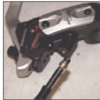
3. Unscrew the connecting bolt and remove the line from the lever.