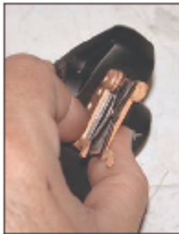
1. Remove the brake pads.