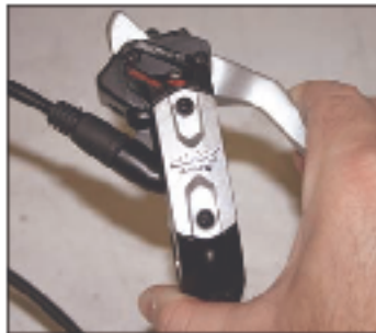
2. Squeeze the lever a few times to extract the pistons. Do not let the pistons come completely out of the cali-